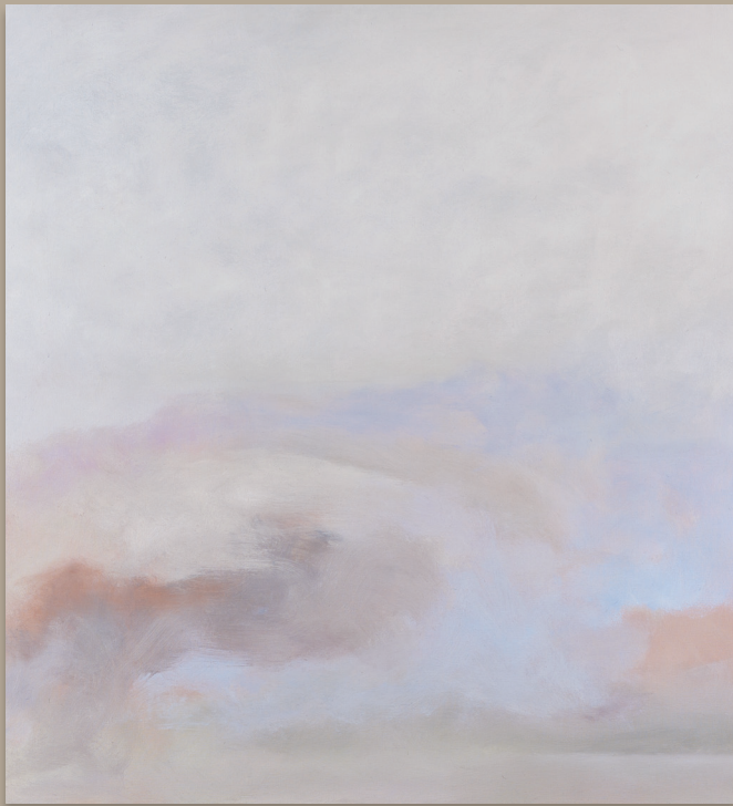
above: Separate Ways: Storm and Sea , 1975, 122 x 112 cm (48" x 44") o/c 608

Discover the artist, his works and his inspiration in 2016.