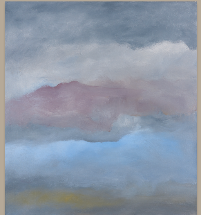
cover: Wind from Wind'ard , 1983, 122 x 112 cm (48" x 44") o/c 1346

This is a guide to the solo exhibitions of Jon Schueler across Scotland in 2016.