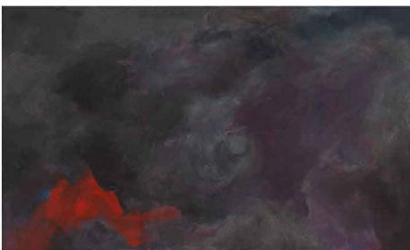
To Advance Against , 1989, 36 x 60 in/91x152 cm, (o/c 1530)

Fort Wayne, Indiana March 27 - June 13, 2021