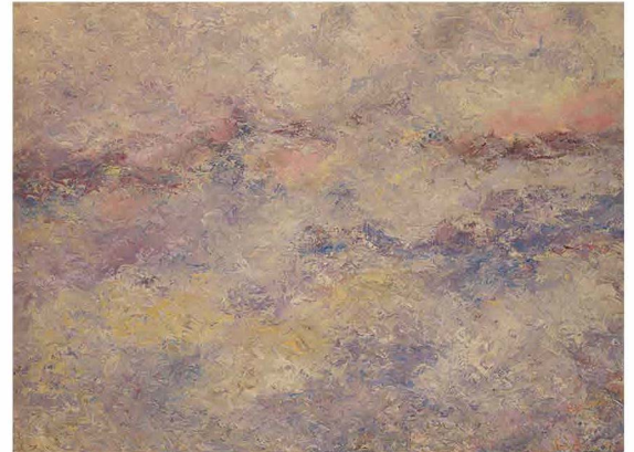
Summer Sea , 1956, 18 x 24 in/46 x 61cm, (o/c 56-33)