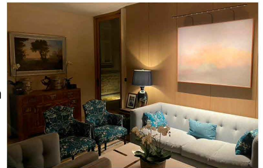
Separate Ways: Living , 1975, 40 x 48 in/101 x 122cm (o/c 619)